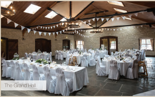
The Grand Hall

I wanted to say a massive thank you to you and all your staff at The Barn for making our wedding day amazing, there was nothing we could fault from the whole day so we cannot thank you enough and we will certainly be recommending The Barn to all our friends and family (The food was amazing!)