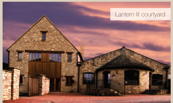
Lantern lit courtyard

Our charming function rooms, superb catering, Cotswold stone walled garden and lantern-lit courtyard make us the ideal venue for a memorable occasion. We have two large function rooms, two break-out rooms and plenty of outdoor space. Whatever kind of event you are planning, we have the facilities to accommodate you.