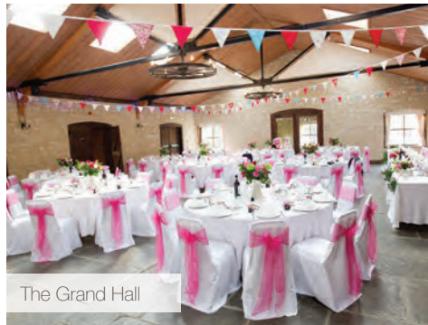
The Grand Hall