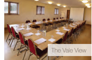
The Vale View