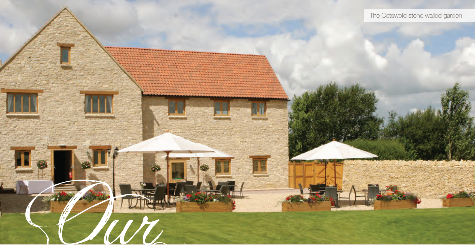
The Cotswold stone walled garden

I wanted to say a massive thank you to you and all your staff at The Barn for making our wedding day amazing, there was nothing we could fault from the whole day so we cannot thank you enough and we will certainly be recommending The Barn to all our friends and family (The food was amazing!)