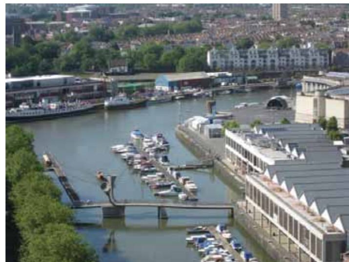
Romantic view from top of the hotel

The Radisson Blu Hotel Bristol is a tastefully designed, eye-catching building in the centre of the city, close to most of the city's cultural treasures including the ss Great Britain.