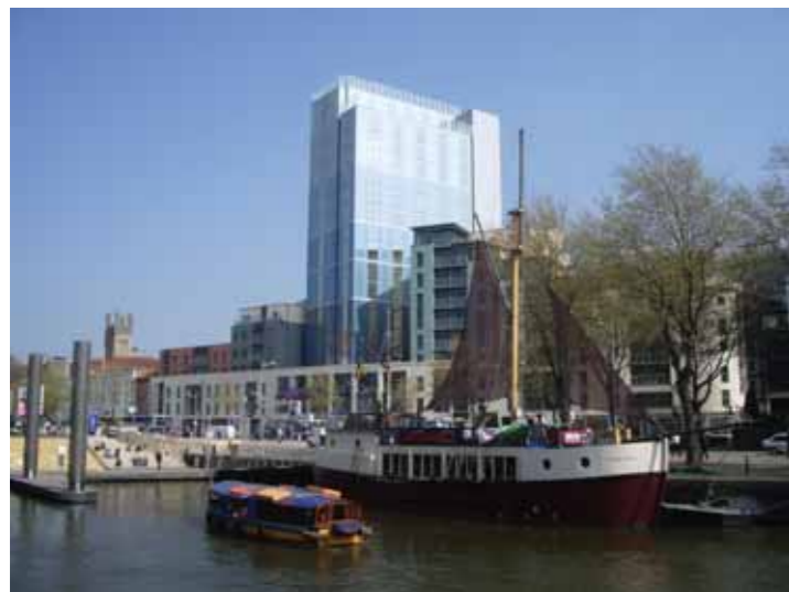
View of the Radisson Blu Hotel Bristol