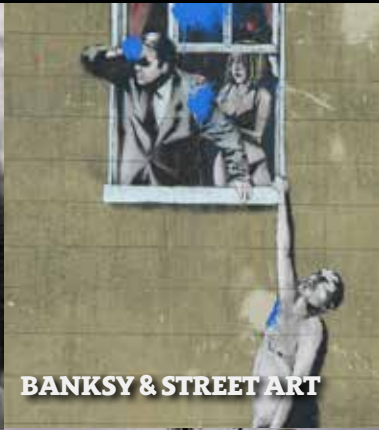
BANKSY & STREET ART