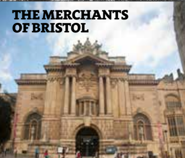
THE MERCHANTS OF BRISTOL

A very diverse city with its own currency, the Bristol pound, Bristol is one of the UK's most progressive and exciting cities, with numerous festivals throughout the year. Discover Bristol's 1000 year history.