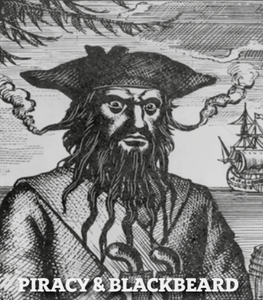
PIRACY & BLACKBEARD